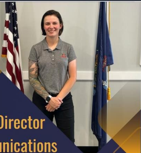
Deputy Director of Communications